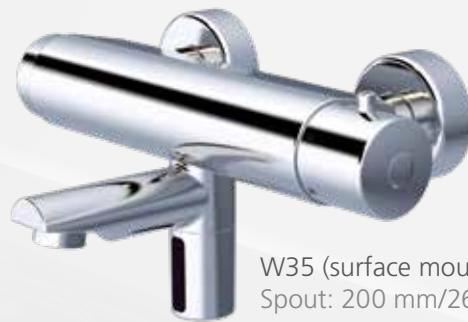
W35 (surface mounted) Spout: 200 mm/260 mm

CONTI+ offers you hygienic solutions made of chrome plated brass that are particularly suitable for sanitary sectors with the most stringent hygiene standards. With electronic faucets and washroom equipment from CONTI+, facilities such as hospitals, teaching hospitals, retirement homes and nursing homes, as well as food processing establishments, are ideally equipped. The anti-scalding protection also offers additional safety.