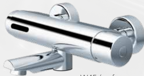
W45 (surface mounted) Spout: 200 mm/260 mm