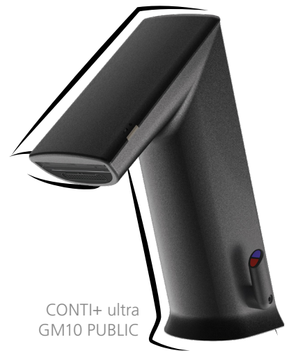
CONTI+ ultra GM10 PUBLIC