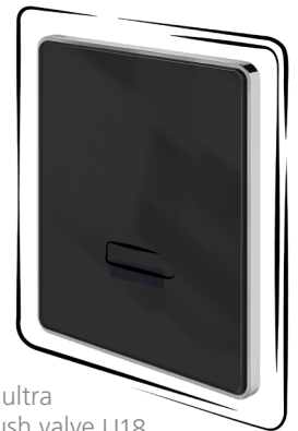
CONTI+ ultra Urinal flush valve U18